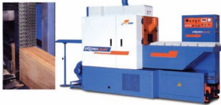
薄片加工机 Frame Saw - Thin Cutting