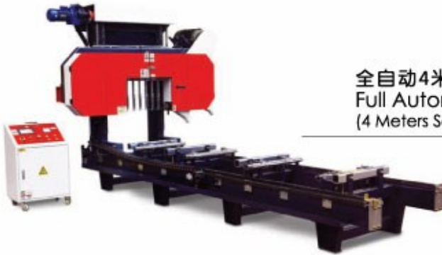
全自动4米原木龙门锯 Full Automatic Log Sawmill (4 Meters Saw Movement)