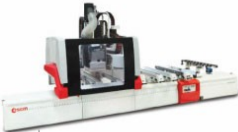
电脑控制刨花钻孔机 CNC Working Centre