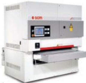
全自动沙光机 Automatic Wide Belt Sander