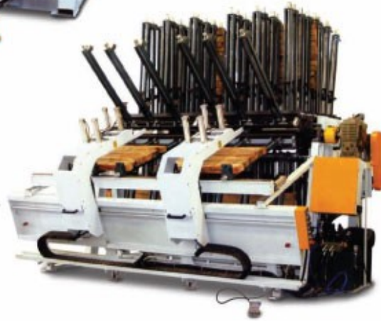
液压拼板机 Hydraulic Clamp Carrier