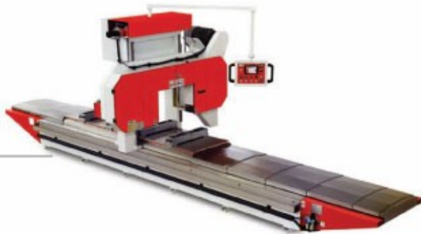
全自动3米原木龙门锯 Full Automatic Log Sawmill (3 Meters Table Movement)