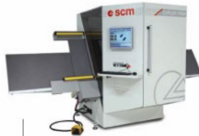
全自动钻孔开槽机 CNC Boring & Grooving Machine