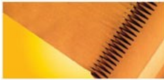
全自动连续式梳齿 | 涂胶 | 齿接生产机 Full Automatic Finger Joining Line