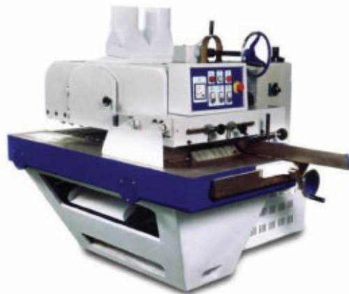
多片锯 Multi Rip Saw