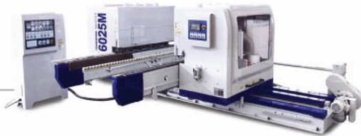
实木双端铣 Double End Tenoner Machine