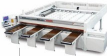
全自动裁板锯 High Performance Panel Saw