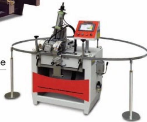
全自动磨齿机 Full Automatic Grinder Machine