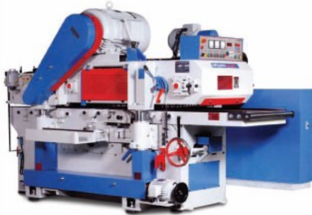
双面刨机 Double Side Surface Planer