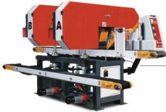
卧式带锯机 Horizontal Band Saw