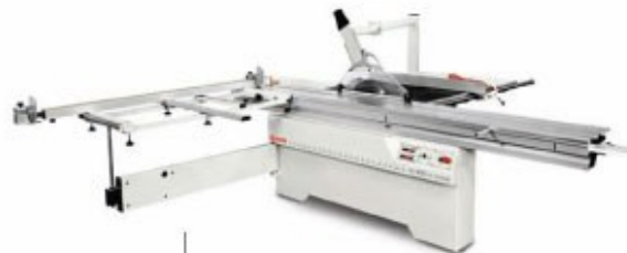
推台锯 Sliding Table Saw