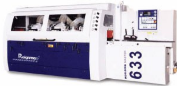
重型四面木工刨床机 Heavy Duty Four Side Moulder