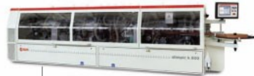
全自动高速封边机 Automatic Edge Bander Machine