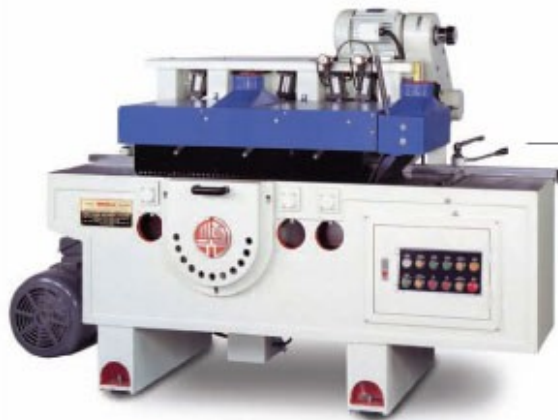
多片锯 Multi Rip Saw