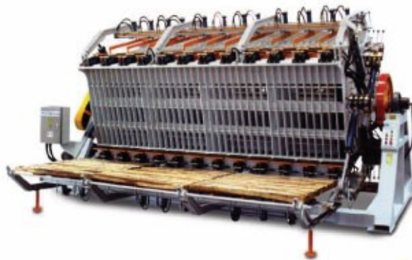
拼板机（四面上翻式） Hydraulic Clamp Carrier (Four Sides, Up Fold Type)