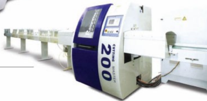
优选锯 Opti-cut machine